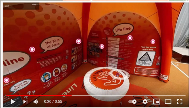
Life exhibition Virtual tour

'All Scripture is God-breathed and is useful for teaching, rebuking, correcting and training in righteousness ...' 2 Timothy 3:16