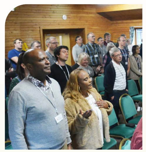
Counties conference 2022