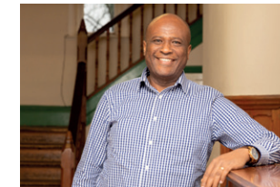
AE – Associate Evangelist ETP – Evangelist Training Programme