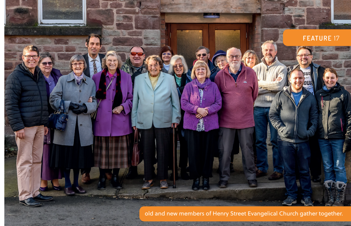
old and new members of Henry Street Evangelical Church gather together.