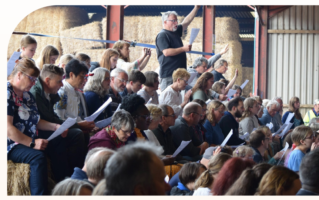
Mission in Action

When projecting into the future, models are a guess, at best. We have reasonable confidence in the weather forecast for tomorrow. The five-day forecast is usually a decent guide, but despite having the biggest computers and hugely complex models, the Met Office's long-range forecasts are about as reliable as Mystic Meg.