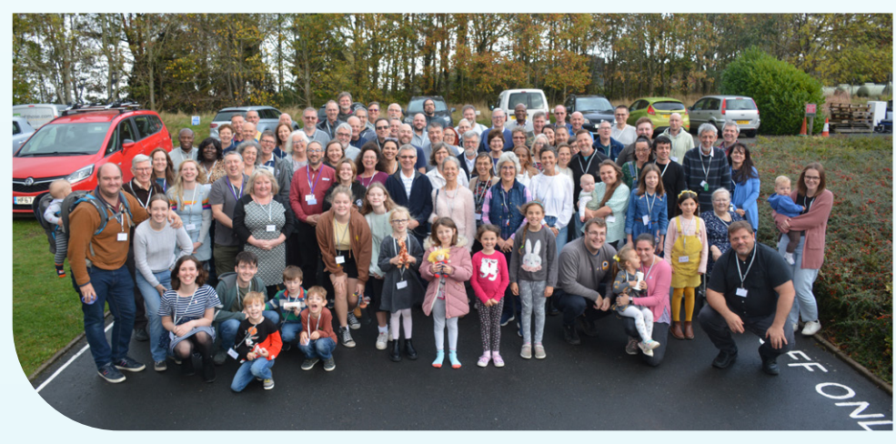
Counties Connect Conference 2022