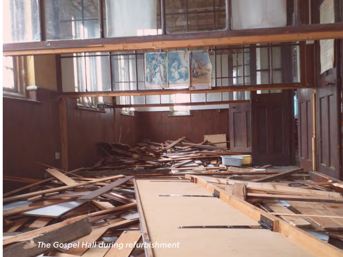
The Gospel Hall during refurbishment

grace. The experience within Counties for church planting, methods, planning, resources and simple guidance from those who have already gone through similar works is invaluable.