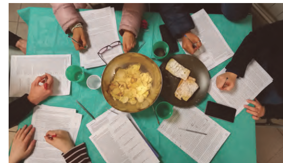
Below: A birds eye view of our GBU Bible Studies