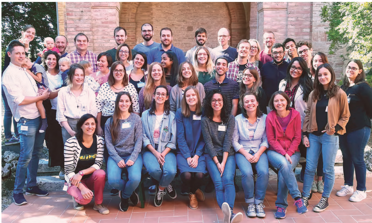
Left: A group photo of a GBU Leaders Training Weekend