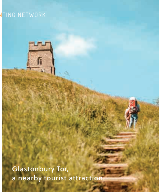
Glastonbury Tor, a nearby tourist attraction.

"We are pleased to say that every week brings fresh encouragements as new folk arrive and as the Holy Spirit blesses and moves in our services. We were delighted to have a baptism recently, and another pray a prayer of commitment. Please pray for God to guide, provide and bless us all in this step of faith."